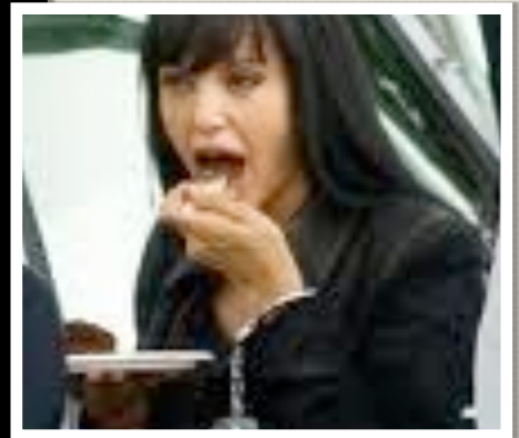
HARD TO TELL, BUT I THINK THAT MIGHT BE A HOPS N' BARLEY CHICKEN ON THAT FORK