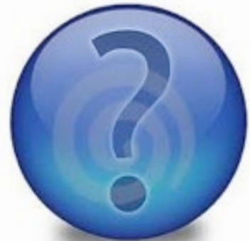
SURPRISES FOR FALL